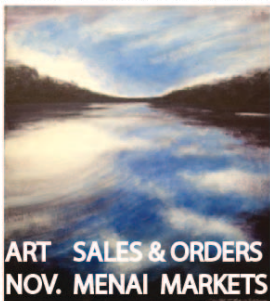
ART SALES & ORDERS NOV. MENAI MARKETS

weekly, holidays, workshops, corporate, teachers, groups, LADIES, TEENS, KIDS, HSC