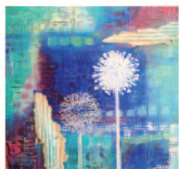
TERM 4 LADIES CHRISSY PRESENTS

weekly, holidays, workshops, corporate, teachers, groups, LADIES, TEENS, KIDS, HSC